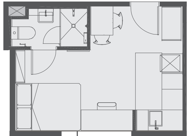
FLOOR PLAN B › STANDARD STUDIOS ONLY

Standard and Premium studios are available.